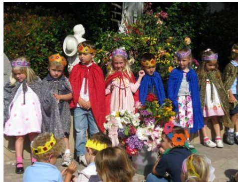
The M-W-F court for our Marian Celebration.

May really couldn't have been merrier, but it was filled to the brim. We accomplished a great deal this month. Because Easter was so late, we hit the road running when we returned. There was so much to do and too little time.