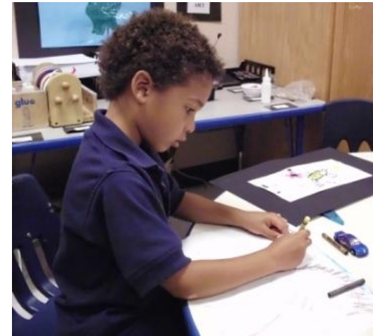
Growing success with Dayton (M-W-F Lions).

their clothes for a few more weeks. We are reminded of the beginning in September when we talked about the mystery of growth, like the hidden seed that sprouts and grows without us knowing how it happens. Slowly, and yet not so slowly when we look back, the young child grows.