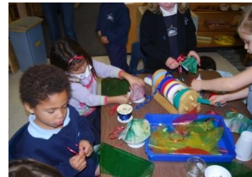
The M-W-F Lions consider different options for creating tentacles for their jellyfish.

Prior to the zoo trip, we will be visiting Soloman's Bakery in Laguna Hills to learn about the business and how to make Monkey Bread. This trip is planned for Thursday, March 3 and Friday, March 4. The transportation will be parent drivers with chaperones. Any driver or chaperone must be fingerprinted and safe environment trained. You still have time to fulfill this requirement, but you must do