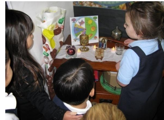
The T-Th Teddy Bears celebrate the birth of the Baby Jesus during the Christmas season.

It is already time to think about plans for next year with your child's educational future. Registration will take place in 3 phases. Re-registration will take place in the school office on Tuesday, February 8 and Wednesday, February 9. This is for families who currently have children in the preschool and will be returning next year. It includes siblings that will be attending next year as well. At the time of registration, you should request your