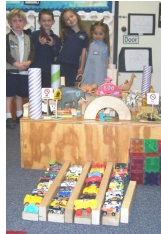
Charlie, Dominic, Lilianna and Evelyn proudly display their zoo "exhibit", including the parking lot.

Building confidence also means allowing mistakes, disappointments and frustrations to become an accepted part